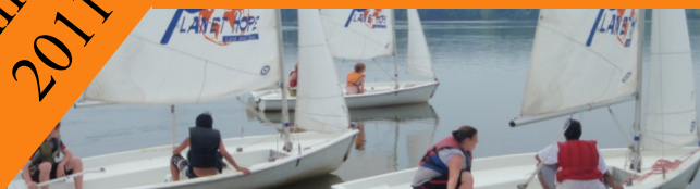
Small Boat Sailing Camps