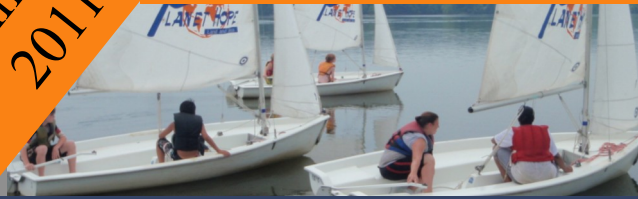
Small Boat Sailing Camps