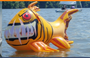
Cruising Camps (overnight)