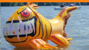
Cruising Camps (overnight)